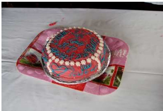
40 th Anniversary Cake