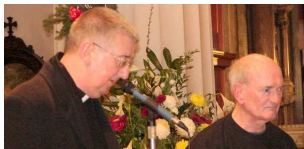
Archbishop Martin praises "man of principle" as atonement priest ends epic walk in the Pro-Cathedral.