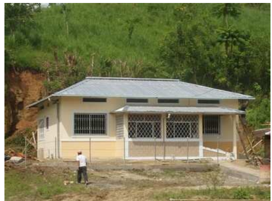
New Parish House Novillo

As I've indicated before, it will be a "parish" house. The central room will have a huge table that will be a symbol of the parish. Round it we hope that the lay-people will gather to guide the parish. Thus I would expect that it will be a place where the parish council, catechists and other leader groups will gather. I hope to brainwash the deacon into seeing it that way. Parish House = Open House. Hence the "round table" symbol.