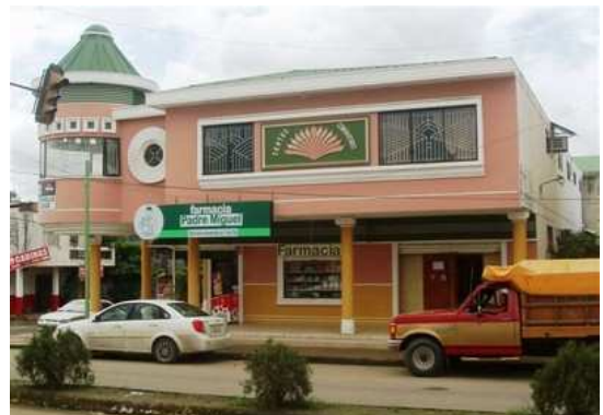
Pharmacy called after Chris Fitzgerald OSA