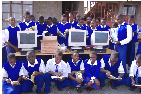
The computers arrive