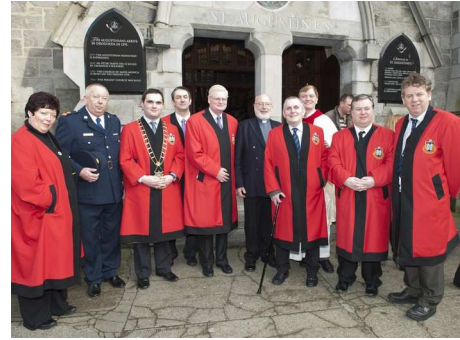
Members of Drogheda Corporation and invited guests

On Sunday, February 5th we celebrated our annual Mass for all those touched by suicide. This commemorative event commenced in 2007 and is organised in conjunction with the local suicide support group SOSAD (Save Our Sons and Daughters). Some other Augustinian communities across the province now join in this commemoration. On the day the church was thronged, possibly an indication of the extent of the problem in our society. Very many of those present have been touched, directly or indirectly, by suicide. The SOSAD organisation exists to save people from suicide and help those already bereaved. They also work to raise awareness of suicide and break the stigma surrounding it. Contact details. www.sosadireland.ie and info@sosadireland.ie