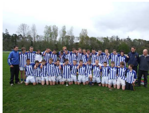
Good Counsel College U-14 Hurling Team

Good Counsel College came out on top of thrilling contest in Thomastown on Friday 4 th as they overcame St. Kieran's College to win the Leinster Colleges U-14 hurling title and claim the Dr. Barry Cup. In what was a highly competitive game with a fantastic standard of hurling, the skill and determination of the New Ross boys deservedly prevailed on a score line of 3-8 to 2-9