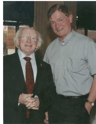
President Michael D Higgins visits Drogheda

Given our present dire economic circumstance, we expect a much greater demand on the 'fruits' of the Giving Tree this year. We will have the tree in place from Sunday next, the First Sunday of Advent. We will already have collected 'wish lists' from a number of needy individuals and some charitable groups. We will have written out these 'requirements' on little labels and placed them on the 'Giving Tree'. The idea is, of course, that you should take one of the labels away with you and purchase the item specified. You would take that gift to the Mass of Giving on Sunday, December 11th at 11.00. Otherwise, you would hand it in at the Priory Office at your leisure (but before that date!). Among items requested in years gone by were Vouchers for various local stores, a €50 note, a couple of duvets, and so on. So we have plenty of notice to get our act together on this one. Our organising committee will then ensure that your gift reaches its destination in good time for the Christmas. This normally works very well and the needy are deeply appreciative of the gifts given.