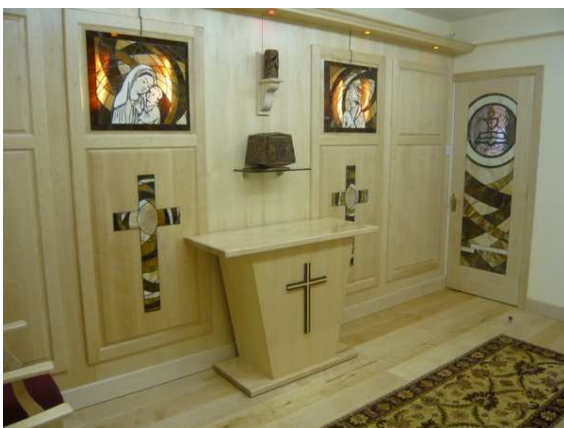
New Prayer Room, St Augustine's Priory, Cork.