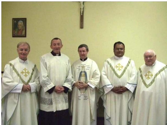
Augustinian Pilgrimage to Our Lady's Shrine at Knock Saturday 17 th July 2010