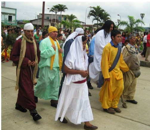
Palm Sunday in Flavio